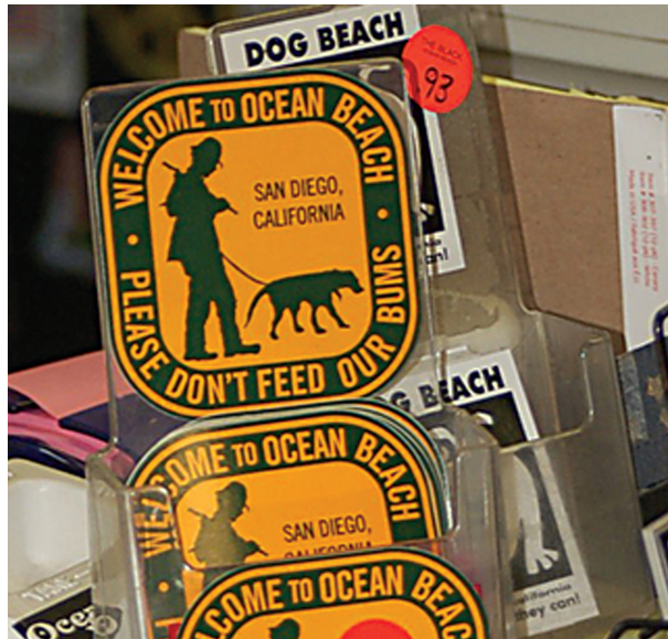
A black eye for the Black?