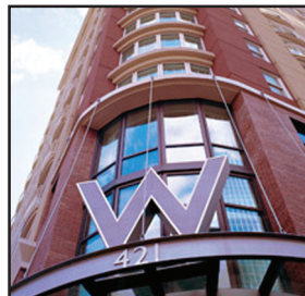
W is for whore?

But the surprise fades when you pause to remember that urban redevelopment is largely a matter of economics. The anonymously authored report notes that "Economic rejuvenation relies, first and foremost, on providing people a place where they'll want to go and spend their money. That starts with desirable goods and services — obviously not an issue in this case — but it also includes atmosphere. If people