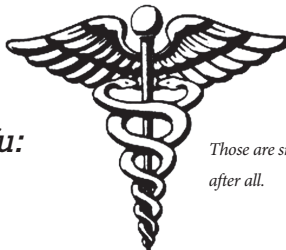
Those are snakes, after all.

Whooping Cough Outbreak Tied to County Health Snafu: Patients Injected with Live Disease Culture