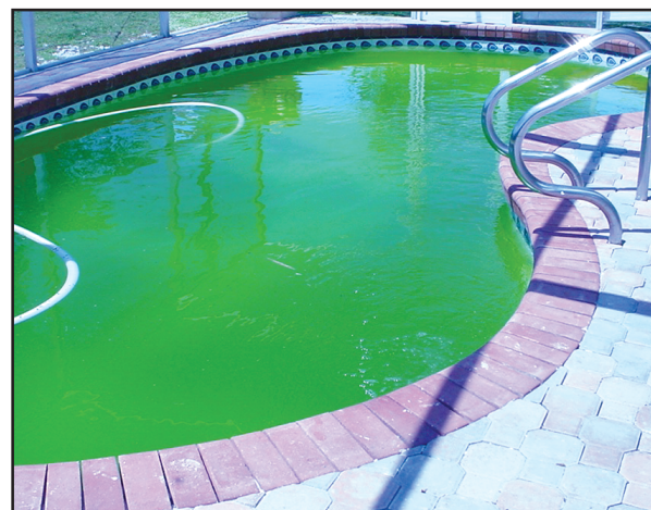
Your new filling station?