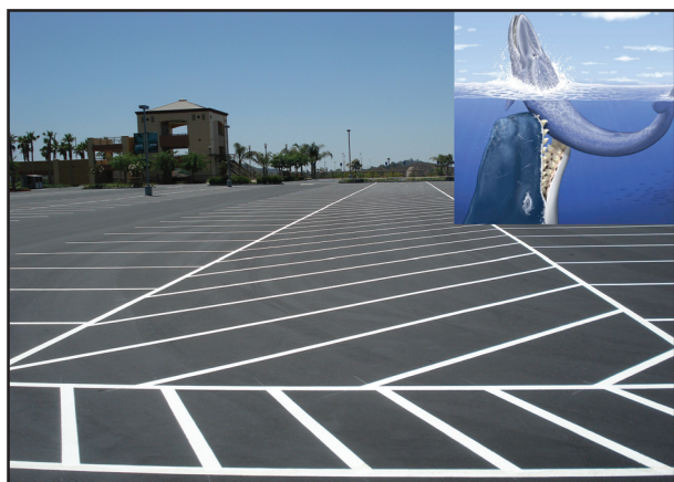
Diagonal lines clearly indicate the whale’s burial site. Inset: artist’s representation of the newly discovered whale in its pre-fossil days, plus unrelated super-toothed giant sperm whale.

San Diego Zoo officials opt to seal newly discovered whale fossil on zoo property under layer of protective asphalt, “to ensure that this momentous discovery is preserved undisturbed for future generations. Centuries from now, the children and parents of San Diego will thank us for not greedily excavating this historic discovery for ourselves, and for allowing them to experience the thrill of uncovering the ancient past. And, who knows, maybe in three or four hundred years, they’ll have the parking issue sorted out as well.”