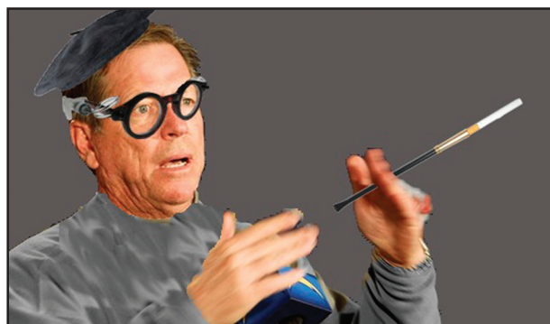
“The world of professional sport is not a simple binary system of wins and losses — it is a fluctuating landscape that admits countless shades of gray. I am hoping my visual appearance will help you to understand this.”