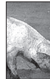
Many Chargers have been treating them like greased pigs.