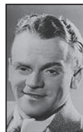
In 13 Rue Madeleine , James Cagney plays a spy chief whose slip in judgement costs him dearly.