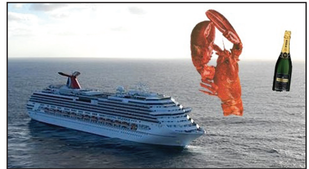
You get the picture. Get it? You "get" the picture? Ha ha!

"God, but it was awesome," said Javier Bustamante, who has spent the past ten years washing dishes for rotund Americans fond of eating their own weight in canapés during weeklong excursions in a boat outfitted with more amenities than your average