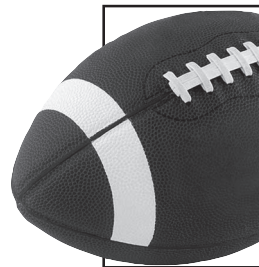
Football are sometimes referred to as pigskins.