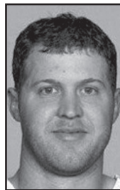
Mike Scifres is a genius punter whose kicks are nevertheless blocked by opposing teams.