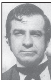
Walter Matthau coached The Bad News Bears .