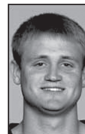
Nate Kaeding had a slip against the Rams that cost him dearly.