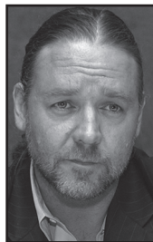
In A Beautiful Mind , Russell Crowe played a genius mathematician whose talents were nevertheless blocked by schizophrenia.