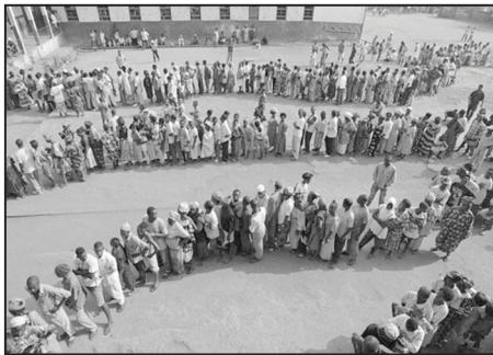
Scores of illegal immigrants and drug mules wait in the hot sun for their turn to pass through one of the few remaining tunnels between Mexico and the United States.

Cuervo, a longtime press representative for the Tijuana drug cartel, was referring to the November 4 discovery and shutdown of one of the busier underground drug tunnels between Tijuana and Otay Mesa. Following the shutdown, which included the seizure of the aforementioned