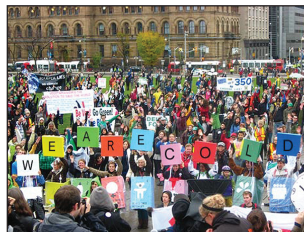
...but these people did it all at once, and in the same place.

H undreds gather in downtown San Diego to protest overnight lows in the 30s and 40s. "It's bad enough that, thanks to the housing bubble, my house is underwater," complained one cranky person in a sweater. "Now you're telling me that the water is frozen, too? I moved here from Minnesota