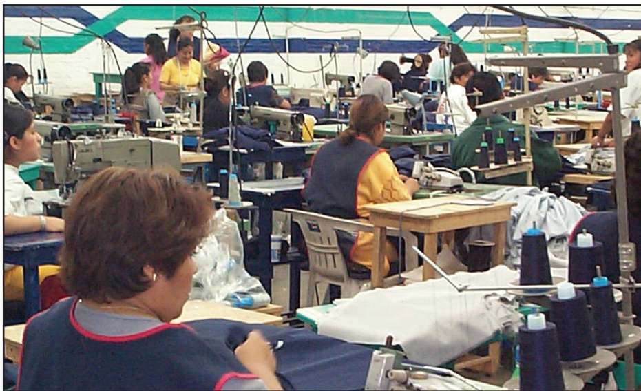
A still from Maquiladora's dramatic climax. Or at least, from a scene maybe near the end of the film.