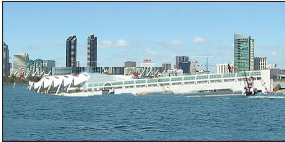
San Francisco's got a waterfront ballpark! And they're a world-class city!

On the (New) Waterfront: after flood-spawned mudslide