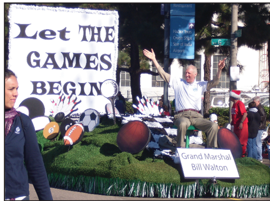
Parade grand marshal (and NBA great) Bill Walton tries his best to pretend that bowling, pool, and checkers belong on the same float as football and basketball.