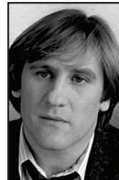
In 1492: Conquest of Paradise , Gerard Depardieu played an explorer who comes to the Americas.