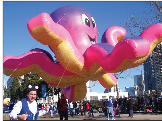
City officials present Timmy Tentacle, the new mascot for San Diego's city government.

"With his eight arms and hundreds of suction cups, Timmy always finds a way to grab hold, squeeze, and suck!"