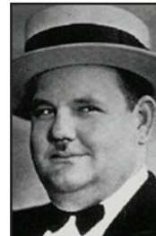
Out on the road with Stan Laurel, Oliver Hardy was forever being gotten into another fine mess.