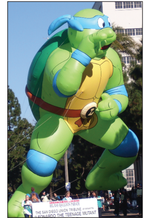
Leonardo the Teenage Mutant Ninja Turtle, new mascot for the soon-to-be-privately owned Miramar Landfill, puts a hand to his nose to fight off the stink. "I may have been created by radioactive sewer ooze, but this is ridiculous!"