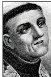
In 1749, Fra Junipero Serra (built the mission that gives Mission Valley Center its name) came to the Americas.