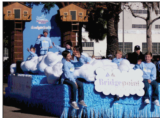
The Bridgepoint Education Dream Float: "Dreaming of a quality, affordable education? Keep dreaming!"