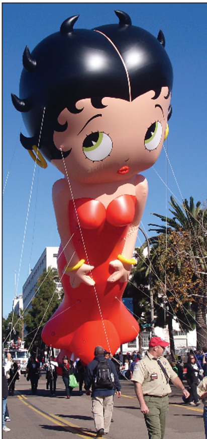
San Diego Sex Workers' Advocacy Group (SD-SWAG) mascot Betty Boop leans forward and puckers up.

Scenes from the 2010 Big Bay Balloon Parade