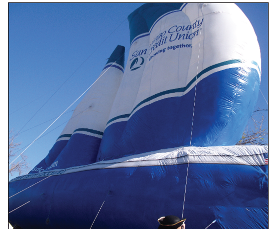
Really? San Diego County Credit Union? A financial institution today taking the theme of a ship "sailing the high seas"? Sometimes the jokes about terrifying plunges and the constant threat of being completely swamped just write themselves.