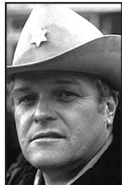
In First Blood , Brian Dennehy played a sheriff who aimed to keep his town boring.