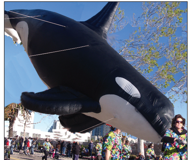
In the parade's only snafu, Shamu the killer inflatable whale briefly pinned a volunteer to the pavement.