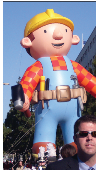
San Diego Civil Employees' Union mascot Bob the Union Builder gazes imploringly up at the clock, waiting for that 5 o'clock bell.

"With his eight arms and hundreds of suction cups, Timmy always finds a way to grab hold, squeeze, and suck!"