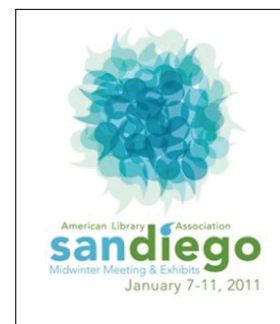
A bowl of commas cereal?