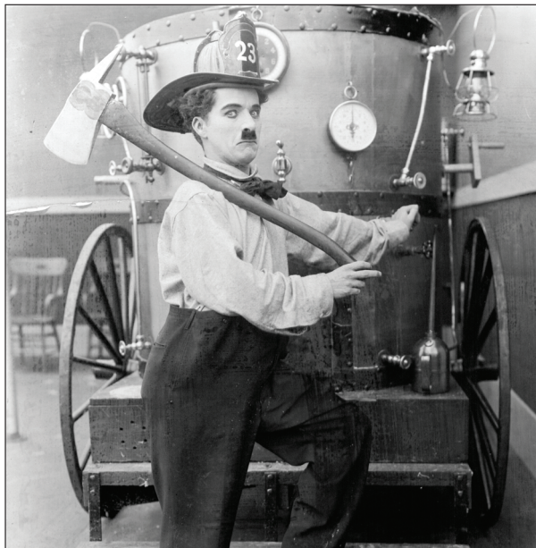
I feel safer already.

already had great success turning over IT services and the landfill to private companies, with Street Maintenance and Parks & Recreation to follow in short order. This next step just made good fiscal sense.” As of press time, negotiations to hand over police services to Keystone Kops, Inc. are ongoing.