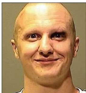
Is this man smiling because he's coming to America's Finest City?