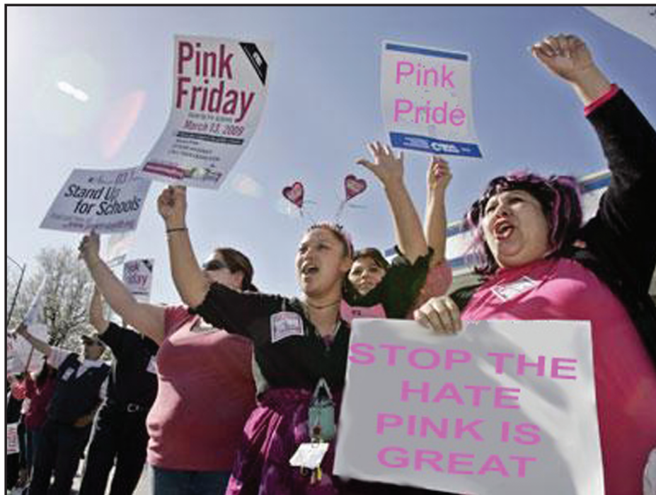
Presumably, "In the pink" is still okay.

Camp Pendleton Marines Look for the Bright Side of Libyan Engagement Kabul: 9148 miles away. Baghdad: 7726 miles. Tripoli: only 6877 miles!