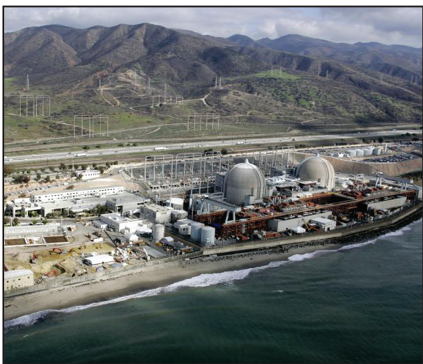
That beach! Those mountains!