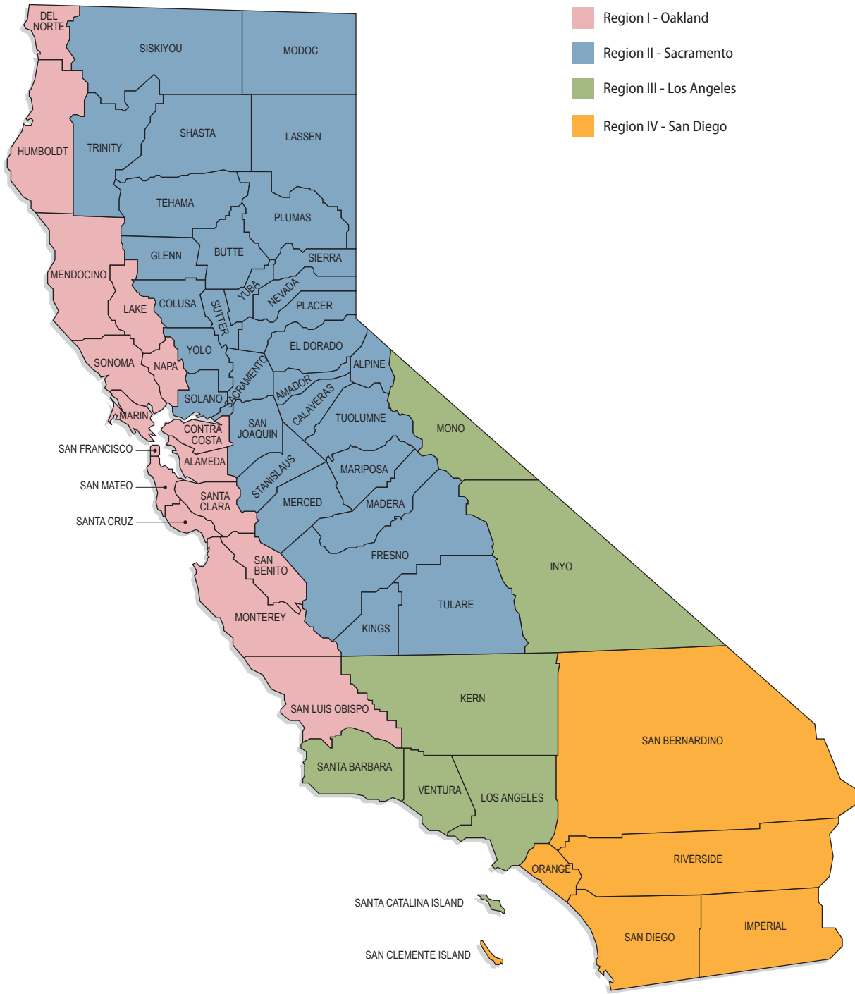
Figure 1 Territories of the Division of the State Architect's Regional Offices