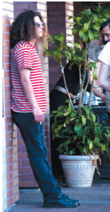
Waldo, fallen off the wagon.