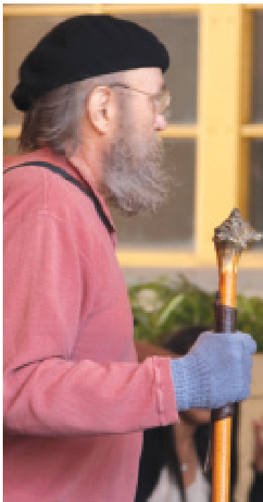
Late for Warlock Poetry night.

The part of your personal pizzazz that transcends your rotating attire. Here are some San Diegans whose locks seem to do all the talking.