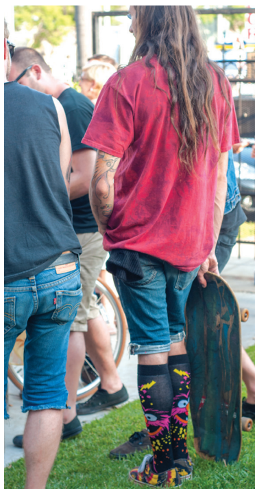
Skateboard! Skateboard! Me love skateboard!