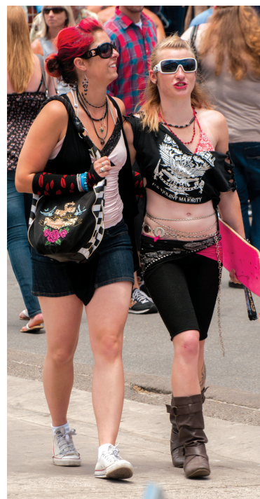
THE CAPTION: Apparently there are still a few bugs to be worked out with the Avril Lavigne cloning machine.