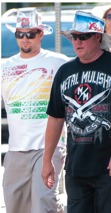
Who said you couldn't be industrious while drunk?